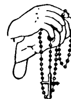
Pray for Peace