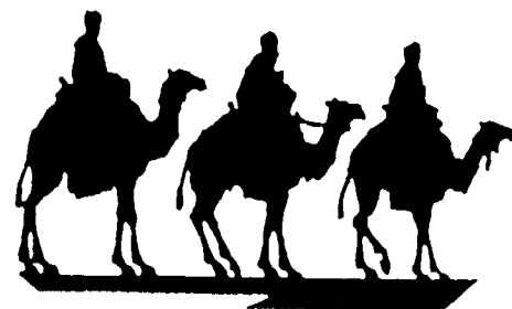
Following That Perfect Light

The St. Maria Goretti Catholic Men’s Fellowship present- Prepare the Way, An Advent Program for Men. Join us as we read and discuss scripture, pray with each other and for each other in preparation of the birth of our Savior. The program will meet weekly beginning on December 2, 2017 from 7:00- 7:45 am in the Monsignor Gauthreaux center. The program is free and is open to any man ages 12 and older. Sign-up sheets are on the table at the entrance of the church.